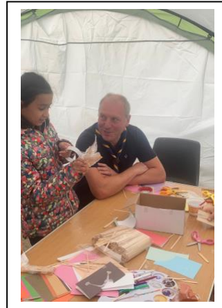
"Visiting Pirate camp at Woolley with Soothill and Asquith Scouting sections"

This commitment and love for Scouting has ensured that we have bounced back stronger than anyone ever expected and for that a big big thank you. We already have some scouting sections saying they are full to capacity, with groups looking to open new sections or even expand their buildings to take on greater numbers. Please don't let anything be an obstacle to your plans for expansion we are here to